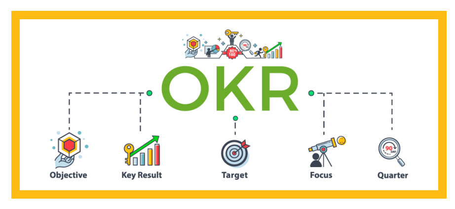
Figure 1: OKR diagram