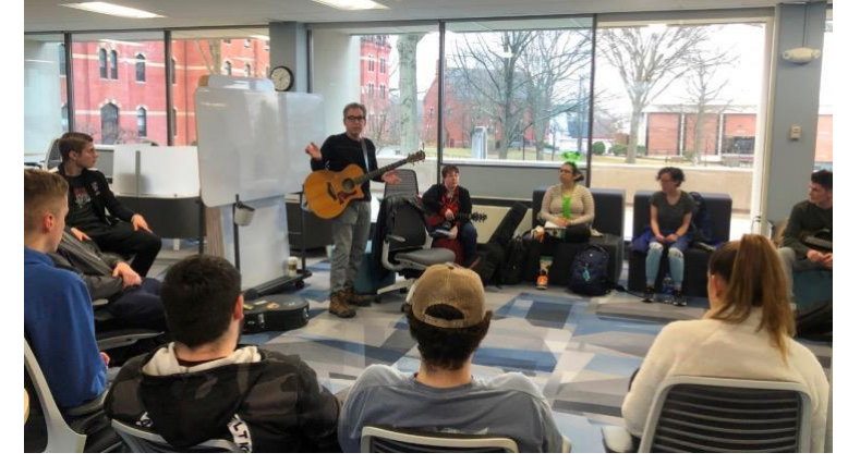
Figure 1: Explore the mysteries of music together

Cooperative learning also has a positive impact on students' interest and motivation in music learning. Cooperative learning can stimulate students' interest in learning. In group cooperation, students can explore the mystery of music and create music works together. This interesting way of learning can attract students' attention and stimulate their curiosity and desire to explore music (Figure 1)<sup>[9]</sup>. On the other hand, cooperative learning can enhance students' learning motivation. In group work, students can encourage and motivate each other. By achieving goals and achievements together, students can feel the value and meaning of learning and become more actively engaged in learning.