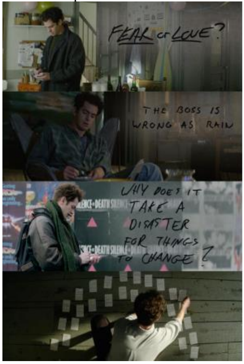
Figure 6: "Louder Than Words" Lyrics

In addition to the two songs, there is also CGI throughout the film when Jonathan writes down brief phrases, which are later revealed to be the lyrics of "Louder than Words" (see Figure 6) on a notepad whenever he witnesses significant events that bring him insight into his life and other worldly affairs. These phrases are shown in a handwriting font next to Jonathan in the frame, but the actual handwritten notepads only appear towards the end when Jonathan lays them on the ground on his birthday. Because these words are portrayed in an unconventional form, the audience is compelled to pay more attention to them and reflect upon the meanings of these lyrics, contextualizing them within Jonathan's experiences.