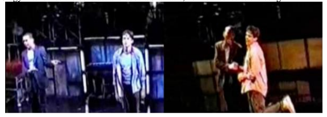
Figure 1: 'No More' musical version; left, old apartment; right, new apartment.

The song "No More" is one of the most notable instances of the use of color and lighting in the musical. In this scene, Jonathan takes a tour of Michael's new apartment as they sing about the benefits of living in a tidy, comfortable space compared to their previous, shabby living conditions. Both adaptations employ two contrasting color tones to accentuate the shift. The theatrical version (see Figure 1) uses blue light to symbolize coldness and harshness during the description of their previous living conditions, while the cinematic adaptation uses a dark, grayish color tone. The portrayal of the new apartment is illuminated by orange light, signifying warmth and joy in the musical adaptation. Meanwhile, the cinematic adaptation (see Figure 2) employs bright, dreamy, and radiant sunlight to emphasize their feelings of contentment. This manipulation of color psychology intensifies the contrast and adds a dramatic, comical sense to the song.