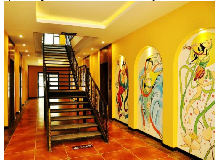
Figure 1: Dunhuang cultural theme hotel

The tourism industry has become a strategic pillar industry in China, with rapid growth in recent years. Many cities have introduced a series of policies to develop tourism in order to vigorously develop the tourism industry. These have provided excellent conditions for the growth of tourism in regions with rich and unique tourism resources. A profound cultural heritage is highly attractive to consumers. Hotel architects usually investigate the cultural environment around the hotel, fully explore the connection between the hotel and historical culture, and thus innovate, showcasing the artistic charm of themed hotels from a unique perspective. As shown in Figure 1, a hotel themed around Dunhuang culture has vigorously developed its tourism industry. With its rich tourism resources and profound cultural heritage, Dunhuang City has strengthened publicity and promotion, improved tourism infrastructure construction, and enhanced tourism products, making Dunhuang's tourism industry steadily develop and become a leader in the growth of tourism in Gansu Province.