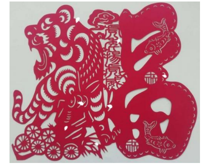
Figure 2: Paper Cuttings under AI

In our country's Paper Cuttings art design, this kind of unified, vivid, rhythmic and rhythmic aesthetic sense, dynamic and static, sparse and dense, diverse and unified, guests echo, virtual reality, vertical and horizontal, black and white contrast, overlapping and interlacing, and other traditional composition rules are common. The material language that expresses the emotions of Eastern culture through the processing and transformation of Chinese folk customs becomes a visual element of the charm of Eastern art that the audience can directly see. This kind of behavior carried out by artificial intelligence may not be called artistic creation, as it does not express its emotions through works and has no creative intention. But as viewers, we seem to have gained some additional interpretations and feelings from the work, as if this artificial intelligence program feels like a 'painter'. The speed at which computers learn painting styles is very fast. Perhaps it takes years for humans to master a certain style, while computers only need a few minutes to extract a certain painting style and proficiently assign any input content to this new style. Exquisite patterns made using laser cutting machines. Each work is exquisite and vivid. As shown in Figure 1, the cock in the Paper Cuttings pattern is holding his head high, which seems to be crowing in the sky, with a manly air.