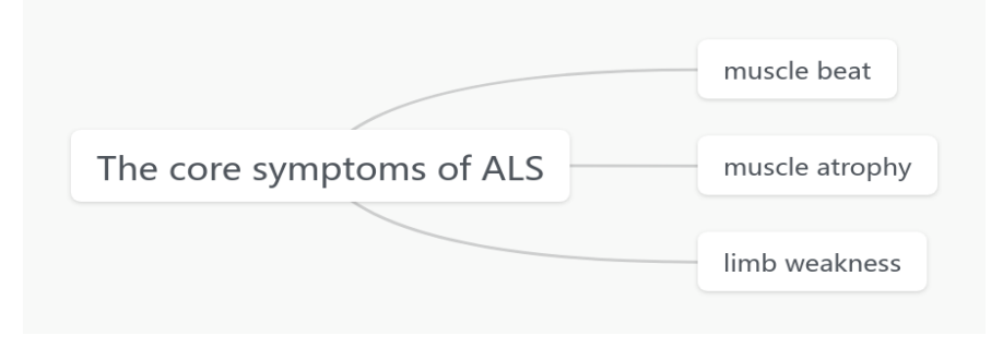
Figure 1: The core symptoms of ALS

The clinical manifestations of ALS are mostly weakness of limbs and muscle atrophy, which is in line with the understanding and diagnosis of Wei zheng in traditional Chinese medicine. The core symptoms of ALS are shown in the figure 1. Wei zheng is mainly a weakness of hands and feet, gradually losing use, based on clinical symptoms; it is believed that ALS should conform to the category of Wei zheng. Moreover, many TCM doctors have achieved considerable curative effect in the clinical diagnosis and treatment of ALS with the diagnosis and treatment idea of Wei zheng [6].