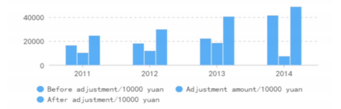
Figure 2: Comparison of accounts receivable balance

(2) Failure to follow the approval procedures