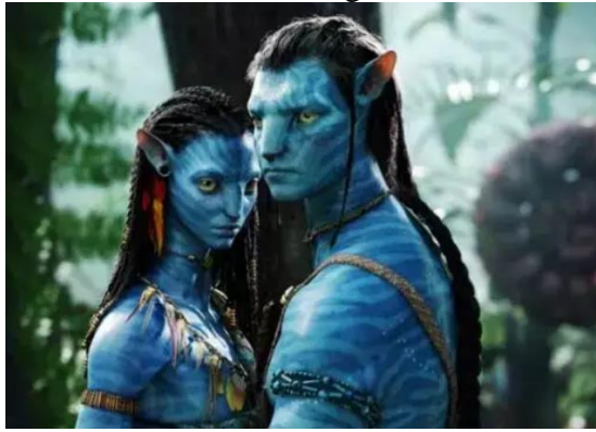
Figure 2: Avatar film (2009)

games, such as the popular multiplayer video game "League of Legends", there are currently 180 million players right now which makes the role setting of the virtual character very important [2].