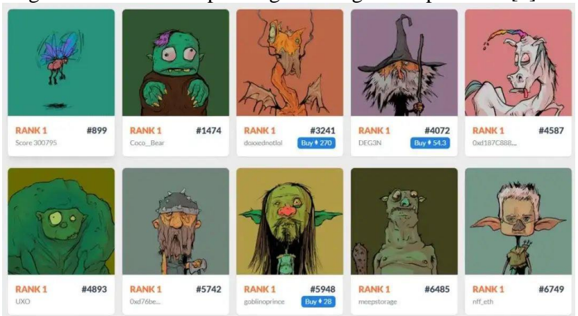
Figure 3: Goblin town NFT

If we look further into the NFT (Non-Fungible Token) market, projects that are considered "blue chips" (blue chip NFTs are usually well-known, stable, and considered a good long-term investment, with creative and unique features (Figure 3), unlike the early NFT avatar projects that only sold pictures, later project owners are increasingly focusing on scene building and extensive empowerment. One project called Boom gala directly helps its NFT holders to build the basic components of their metaverse so that they can move into the metaverse fully furnished. The holder will not only get the avatar, but also the right to use the corresponding 3D image and apartment [3].