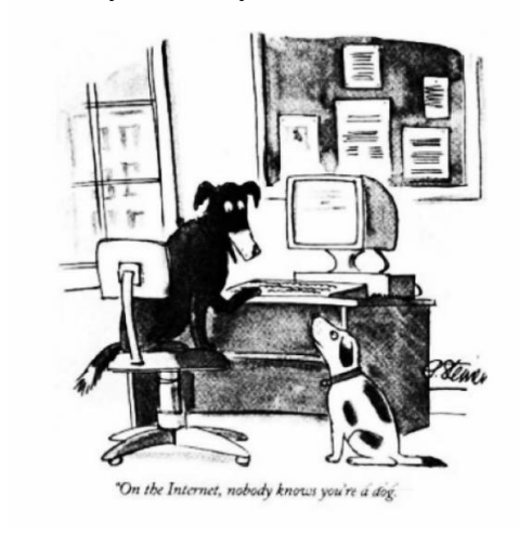
Figure 4: The New Yorker