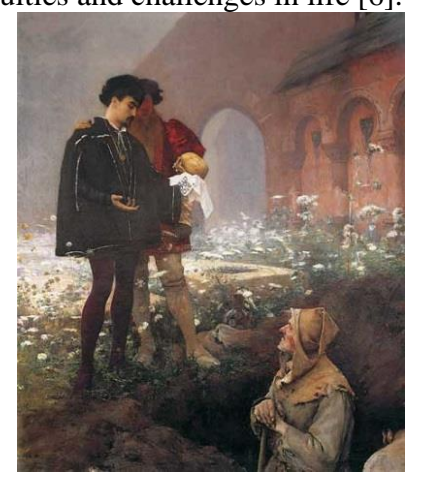
Figure 2: Hamlet

Literary classics often contain rich human wisdom and ideological connotation. Through in-depth reading of these works, college students can learn spiritual strength and enhance their life realm. For example, the image of Lin Daiyu in A Dream of Red Mansions can make college students deeply understand the complexity of human nature and the preciousness of emotion. The protagonist's revenge in Hamlet can make college students think about the values of courage, responsibility and justice, as shown in Figure 2. These spiritual forces can help college students to remain optimistic, firm and brave when facing difficulties and challenges in life [6].