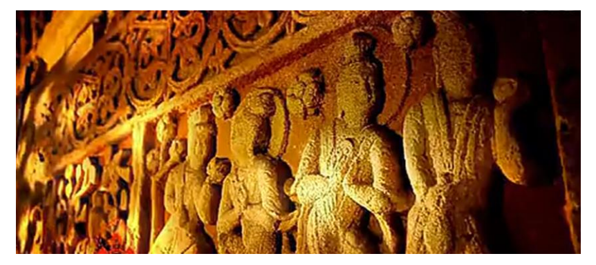
Figure 3: Tourism brand promotional video display screen.