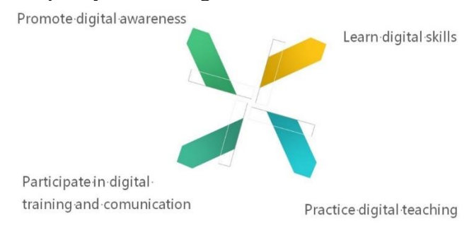
Figure 2: Paths to improve teachers' digital literacy

The construction of teaching resources should be considered from teachers, students, enterprise, industry, technology, and other dimensions. Teachers are the main developers and users of teaching resources, and their educational background, teaching experience, teaching methods, and other factors have an important impact on the development of teaching resources. Students are the ultimate beneficiaries of teaching resources, and their needs and characteristics also have an important impact on the design and development of teaching resources. In the construction of teaching resources, it is necessary to consider the subject needs, learning characteristics, cognitive level, interests, and other factors of students, as well as their acceptance of digital teaching resources and use habits. Enterprises are the destination of students. Therefore, in the construction of teaching resources, factors such as industry characteristics, job demands, professional standards, and other factors of enterprise should be considered, as well as their views and suggestions on digital teaching resources. Live streaming e-commerce industry is developing rapidly in the construction of teaching resources, but also considering the status quo and development trend of the industry, technical level, competition, and so on. In addition, the digital technology level of teachers also directly determines the quality of teaching resources [11].