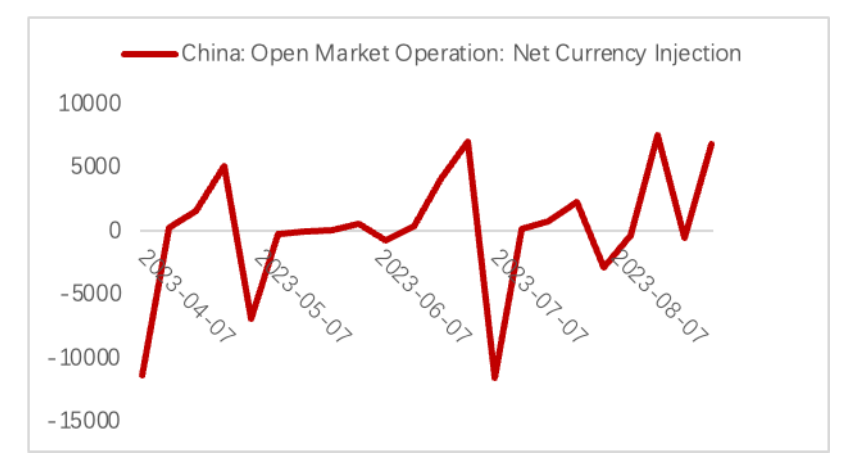
Figure 2: The surge in net central bank money supply (100 million Yuan).