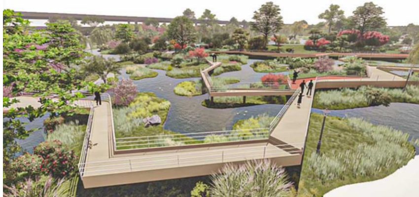
Figure 1: Sponge City's "Sponge" Mode of Autonomous Treatment and Utilization of Rainwater

pollution and urban heat island effect [2].