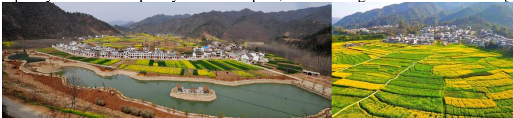
Figure 3: Case study of landscape construction project in rural tourist destination

The present situation of landscape construction in rural tourist destinations is different in different regions, but it shows diversity on the whole. In the future, the landscape construction of rural tourist destinations should pay attention to protecting and inheriting rural characteristic culture, ecological protection and green development, and at the same time innovate and improve the service quality to provide tourists with more diverse tourism experiences [8].