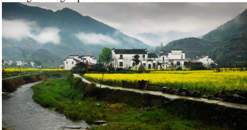
Figure 4: Waterfront Landscape of Rural Tourist Destinations

There are usually lakes, rivers, reservoirs and other water bodies in rural tourist destinations, and the concept of sponge city can be applied to the protection and restoration of water bodies. Through the construction of wetlands, river ecological restoration and other projects, the ecological function of water bodies can be restored, the water quality can be purified and the landscape value of water bodies can be increased [13][14]. At the same time, relevant departments should pay attention to the ecological landscape planning around the water body, create a beautiful waterfront landscape (Figure 4), and provide a better sightseeing experience.