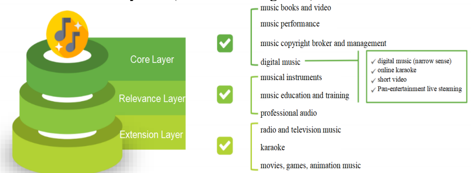
(Data source: iResearch—Research Report on the Development of Music Industry in China)

Since the 1990s, China's digital music industry has undergone many reforms, and the industry structure, industry rules and market operations have progressed with the era. Currently, the industry is developing in a new way, with the digital music ecosystem beginning to take shape.[4] The digital music ecosystem not only takes advantage of the prosperous development of the mobile Internet to open up the ecological management and operation of the whole industry chain in the upper, middle and lower reaches, enriching music content and improving the virtual, interactive and popularization of music communication but also integrates and develops with other industries to extend the boundaries of the ecosystem (As shown in figure 1).