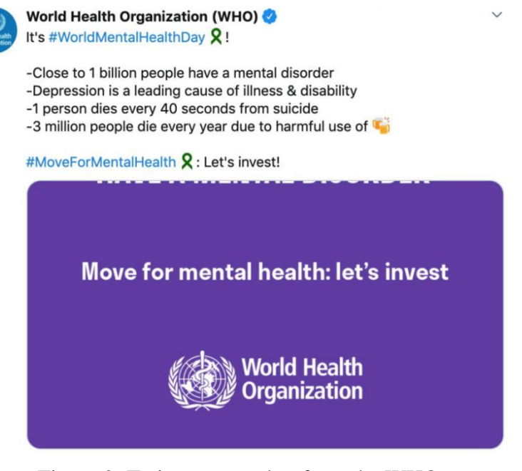
Figure 2: Twitter screenshot from the WHO