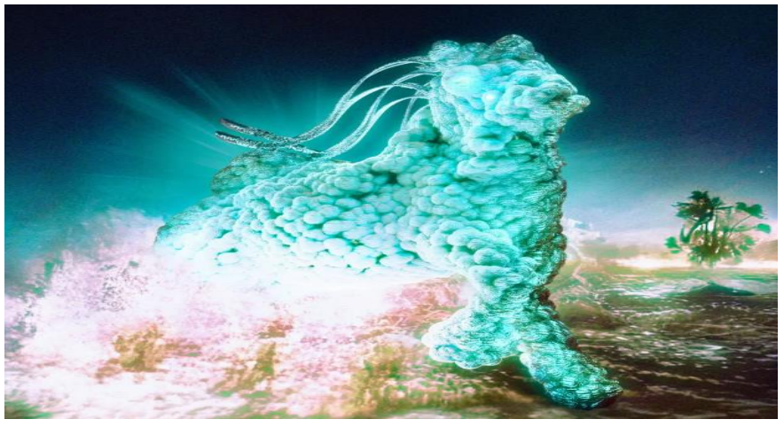
Figure 1: Generation Art

(1) Generation art: Generation countermeasure network (GAN) is an artificial intelligence technology, which can generate realistic images, audio and video, as shown in Figure 1. In the teaching of digital media art, students can learn and apply GAN technology, and generate creative works by adjusting model parameters and inputs. AI can be combined with virtual reality (VR) and augmented reality (AR) to provide a richer and more immersive learning experience. Students can use AI technology to create virtual scenes, interactive elements and personas, thus expanding the creative space of digital media art. This process of generating art not only cultivates students' creativity and aesthetic consciousness, but also enables them to deeply understand the working principle of artificial intelligence algorithms.[4]. I enables creators to collaborate in digital media art projects. By sharing and analyzing data, AI can promote cooperation and communication among multiple students and improve their creative ability and teamwork ability. Although the application potential of artificial intelligence in digital media art teaching is huge, we need to pay attention to some challenges and considerations. For example, data privacy and ethical issues, technical reliability and error, and the balance of man-machine relationship all need to be seriously considered and solved (Figure 1).