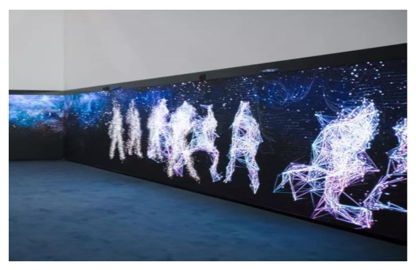
Figure 2: Artificial Intelligence Innovative Digital Media Art Project

(3) Data visualization: Artificial intelligence technology can transform big data into a visual form, as shown in Figure 3, to help students better understand the trends and relationships behind the data. In the teaching of digital media art, students can use artificial intelligence technology to analyze and visualize data and create vivid and intuitive data art works. AI technology can help students present the complex in a visual form, making it easier to understand and analyze. This is very helpful for data collection, research and presentation in digital media art, and also cultivates students' data thinking and visualization ability. This application of data visualization not only improves students' data analysis ability, but also presents a brand-new way of information transmission for the audience. Artificial intelligence can bring many innovative applications and benefits in digital media art teaching. It provides students with broader and richer learning opportunities, expands the creative space of digital media art, and provides intelligent educational support and evaluation feedback (Figure 3).