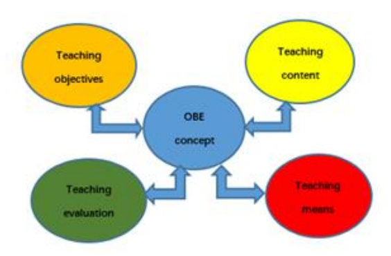
Figure 1: The five-in-one teaching system based on OBE concept