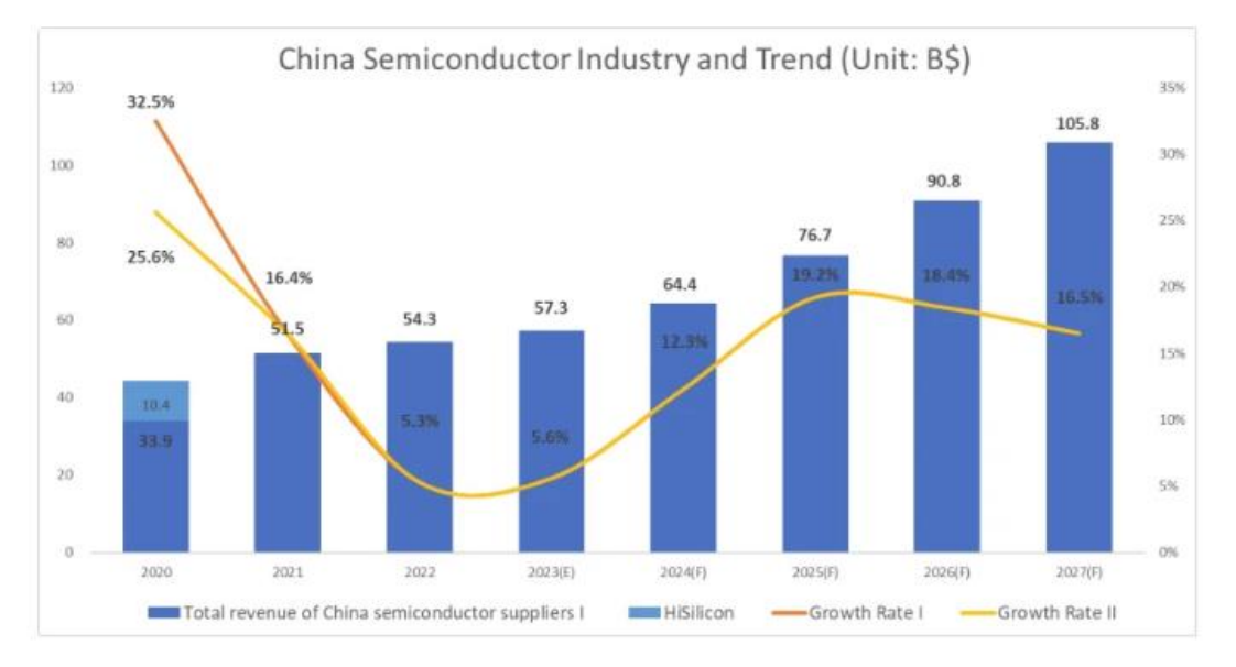
Figure 1: China Semiconductor Industry and Trend from 2020 to 2027

entering a downward cycle, the growth rate of China's semiconductor industry is expected to remain positive in 2022. The top 30 design companies in China had combined revenue of US$29.1 billion in 2022, up 1% year-on-year, which is approximately 214% of the combined revenue of the top 10 Fabless companies. The communications market is the largest application market for China's semiconductor industry, while the consumer electronics market continues to be the second largest market for semiconductor chips in China.