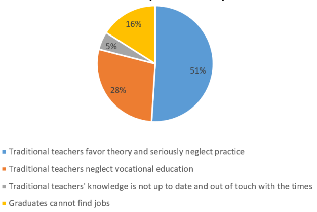
Figure 2: Reasons for students' bias towards double teacher teachers

As shown in Figure 1, 78% of college students say they adapt to the "dual teacher" teacher in primary school. Among the students interviewed, 12% said they would not adapt to a "dual teacher" teacher because they prefer traditional teachers. A interviewed teacher who introduced "double qualified" teachers explained: "When first introduced "double qualified" teachers, half of the students were not suitable. However, with the deepening of the introduction work, most students have adapted to "double qualified" teachers, but there are still some students who are not suitable". These students also have difficulties and poor grades in traditional classrooms. However, when they see other students actively participating in the conversation, they feel motivated to learn under the guidance of "dual teacher" teachers, who have a positive impact on their actual learning.