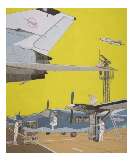
Figure 3: Wings of a Great Nation