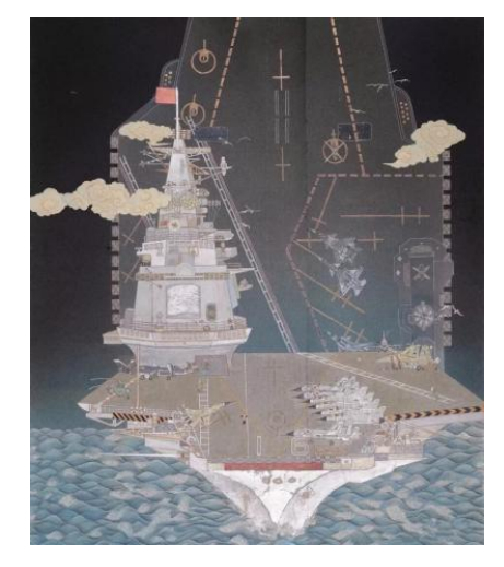
Figure 2: Night at the Naval Port: Chinese Dream