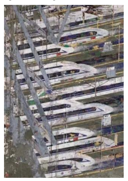
Figure 4: Building Dreams in Space