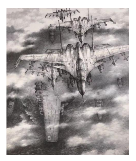
Figure 6: Soaring: 2019

Secondly, the changes in technique innovation and expressive forms are also evident in these artworks. Artists have adopted new painting techniques, materials, and skills, as well as explored different modes of expression. These innovations in technique and changes in expressive forms have brought about unique visual effects and expressive methods, enriching the depth and artistic expression of the works.