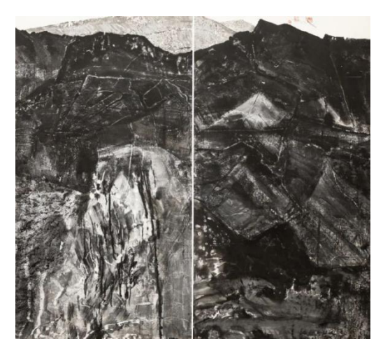
Figure 7: Silk Road Glacier, Zhu Jinhui, 186.5cm×200cm, Chinese painting

In conclusion, contemporary Chinese landscape painting builds upon traditional aesthetics while continuously exploring innovative subjects and expressive forms, with a focus on personalized expression and emotional transmission. This allows contemporary landscape painting to inherit the spiritual essence of traditional landscape painting while adapting to the aesthetic demands of modern society, injecting new vitality into the development of Chinese landscape painting.