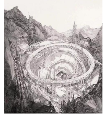
Figure 1: Crafting Dreams: The Under Construction Eye of Heaven

For example, amidst the transition of eras, the exploration of new subject matters extends beyond the conventional understanding of grand landscapes and encompasses the daily lives of ordinary people, including aspects of their clothing, food, housing, and transportation. Architecture, tools, daily necessities, technological products, and weapons serve as tangible manifestations of material development. The connection between scenery and objects is attributed to the genre of landscape painting, signifying a shift from the traditional literati's focus on natural landscapes and flora and fauna to the depiction of new social phenomena [14]. Among the 20 selected artworks in the study, pieces such as "Crafting Dreams: The Under Construction Eye of Heaven" (Figure1)"Night at the Naval Port: Chinese Dream" (Figure2)"Wings of a Great Nation" (Figure3) "Building Dreams in Space" (Figure4)"China's Speed" (Figure5) and "Soaring: 2019" (Figure6) depict unprecedented subject matters, including high-speed trains, radio telescopes, warships, airplanes, and various elements of production and construction. These products of era development directly embody technological advancements and changes in artists' aesthetic perspectives.