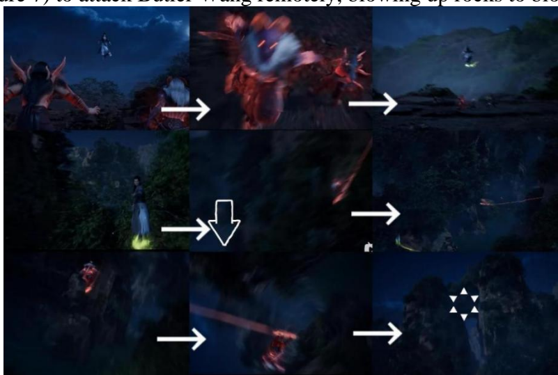
Figure 7: Additional details can be found in the text description.

right corner of Figure 7) to attack Butler Wang remotely, blowing up rocks to block Wang's route.