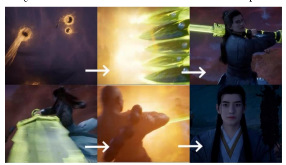
Figure 6: Additional details can be found in the text description.

Han Li needs to get to the weakest point of the energy above to break the energy shield. So we can see an open terrain in the screen, in a translucent hood has a tornado, forming a special space, then the battle logic is very clear: Han Li in the energy hood to dodge attacks, from the energy hood above to fly outside the formation to solve the outside of the small villain led to Tie Luo block, Han Li use the characteristics of the tornado to dodge, unexpectedly sneak attack from behind, two moves end the battle, the energy shield was resolved. Han Li in the first move with a small knife (in Fig 6), the second move with a giant sword, in the pace of the fight also has a progressive relationship. Finally the battle ended, the screen appeared subtitles, Han Li's level is Foundation Phase. This screen treatment is a little more dramatic than telling the audience Han Li's level at the beginning.