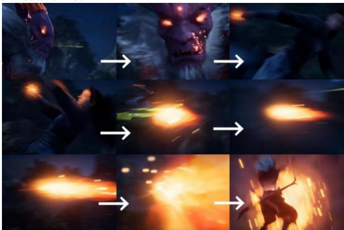
Figure 9: Additional details can be found in the text description.

As in Fig 8, Butler Wang dodged Han Li's attack, and dodged the falling rocks, the terrain became narrower and narrower, from narrow to wide again, is the director's use of camera language to deceive the audience visual time.