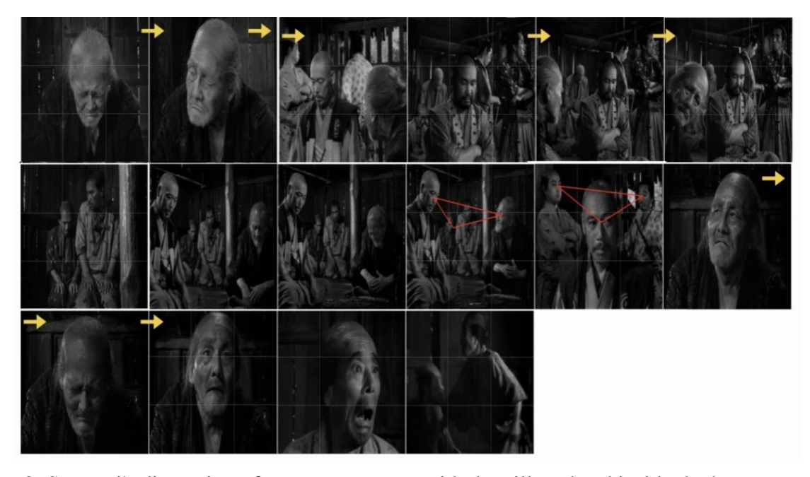
Figure 2: Samurai's discussion of countermeasures with the village head inside the house portrayed in the picture.