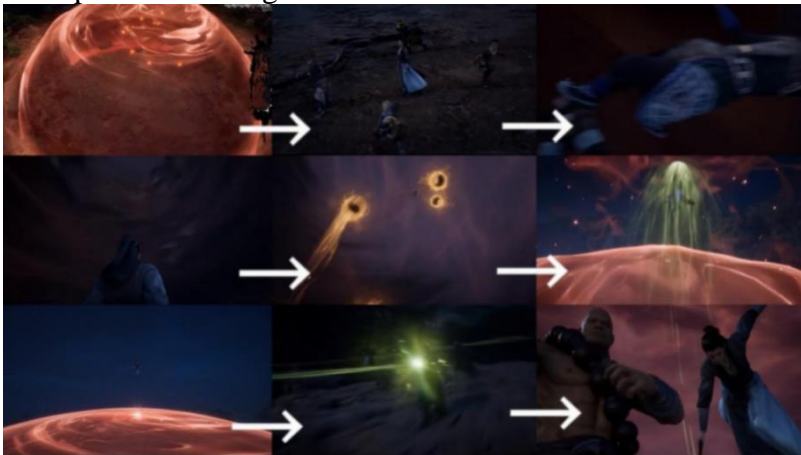
Figure 5: Additional details can be found in the text description.

Meditation Phase of the powerless to fight back.