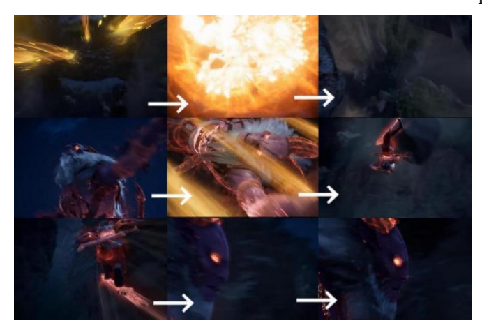
Figure 8: Additional details can be found in the text description.

As in Fig 8, Butler Wang dodged Han Li's attack, and dodged the falling rocks, the terrain became narrower and narrower, from narrow to wide again, is the director's use of camera language to deceive the audience visual time.