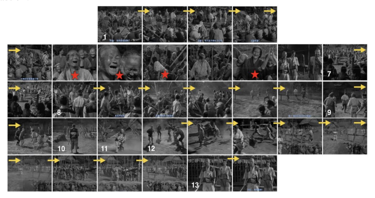
Figure 3: Kikuchiyo's lively intervention during the samurai's gathering of the villagers depicted in the picture.

Since the film clip between 01:43:03~01:46:25, the screenshots are shown in Fig 3. The types of shots that appear in this clip are mainly panoramic, medium, medium close-up, and close-up. In this clip, the feelings expressed in the camera language change a lot in terms of mood shifts, from serious to lively. Some people want to betray before the war, as the leader of the Kanbei's decisive power is excellent, at this time shake the army will certainly suffer defeat, he must maintain the morale of the team, which is an experienced leader must have the quality. At the pep rally, Kikuchiyo once again showed his hilarious skills just right, allowing the nervous peasants to relax again at once. Not only the men, but also the old ladies who had lost their teeth were laughing their heads off.