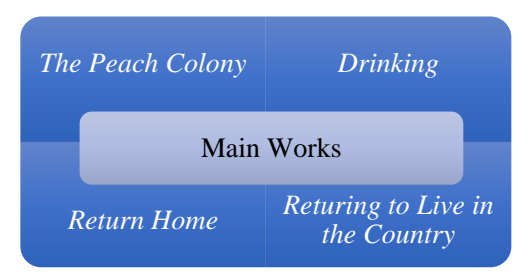
Figure 4: Tao Yuanming's main works

From figure 3 and figure 4, we can clearly see that the two great poets had created great works at different times and established a stable position in the literary world through these works.