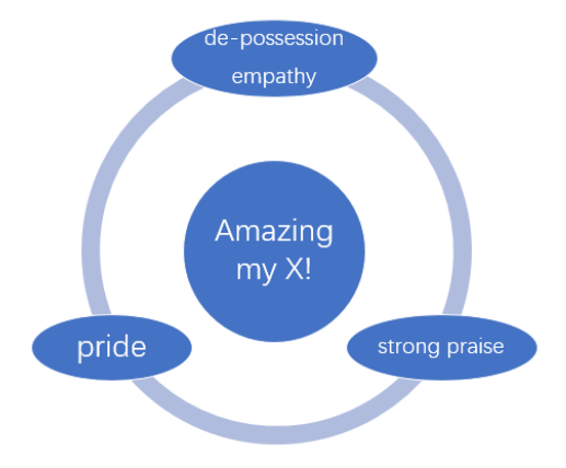
Figure 5: semantic features of "Amazing my X!"

The semantic features of "Amazing my X!" is shown in figure 5.