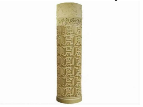
Figure 5: Roman Stone Column with Kui Dragon Ornamentation

The application of Kui dragon ornamentations on stone carvings, the facial elements of Kui dragon ornamentations in the bronze fantasy animal patterns are extracted, and a new continuous pattern is generated by using the method of continuous two sides. The pattern is repeatedly arranged upward and downward, and finally a column is enclosed in the form of silhouette and carved on the stone products, from which the stone products with new decorative patterns are cast, as shown in Figure 5.