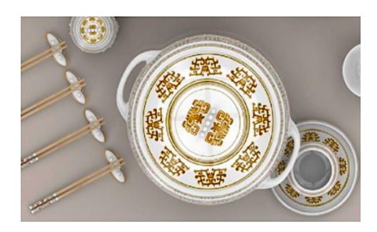
Figure 4: Glutton Ornamentation on Porcelain Products

The application of Kui dragon ornamentations on stone carvings, the facial elements of Kui dragon ornamentations in the bronze fantasy animal patterns are extracted, and a new continuous pattern is generated by using the method of continuous two sides. The pattern is repeatedly arranged upward and downward, and finally a column is enclosed in the form of silhouette and carved on the stone products, from which the stone products with new decorative patterns are cast, as shown in Figure 5.