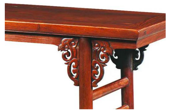
Figure 6: Phoenix Bird Ornamentation Flat Head Case

The application of phoenix bird ornamentation in modern furniture art design, as shown in Figure 6 is to extract, simplify and redesign the phoenix bird ornamentation in the bronzes to form new abstract phoenix bird ornamentations. The new phoenix bird ornamentation is the main design element, and it is presented on the new castings through the decorative techniques of painting and carving.