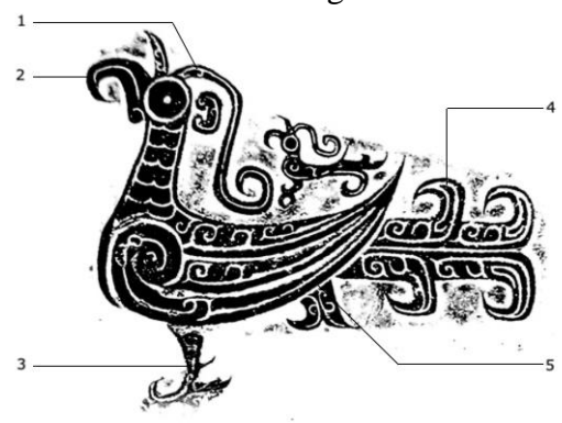
Figure 3: Phoenix Pattern (1. Crown or Horn 2. Hook Bill 3. Foot 4. Wing 5. Body Tail)

Compared with the Kui dragon ornamentation, phoenix bird ornamentation is a common decorative pattern. Most phoenix have plump wings and beautiful body. They often look up, as shown in Figure 3. The hooked beak and wings are the most prominent, but the hooked beak is the primary feature. Some phoenix patterns have no obvious wings.