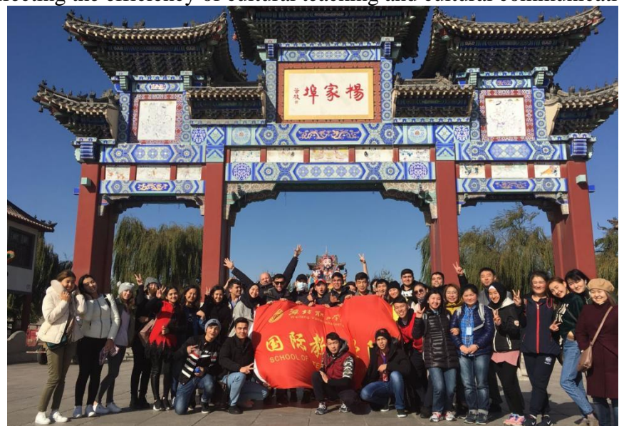
Figure 4: Cultural communication activities

Cultural teaching and cultural communication (Figure 4) appeared at different times. So far, the theoretical and practical problems of culture teaching have been discussed for a long time, including why to teach culture, what culture to teach and how to teach culture. This is a theoretical and practical problem encountered in the continuous development of education, and it is also an indispensable theoretical construction and practical exploration process [13]. Although the theoretical construction and practical exploration of cultural teaching still need to be further strengthened, its goal is clear. There is a close relationship between cultural teaching and cultural communication, but there are also clear differences. However, people often only pay attention to their connections and ignore their differences. Sometimes it even confuses cultural promotion and communication aimed at improving national soft power and cultural teaching aimed at improving learners' intercultural communication ability, which leads to the confusion of two cultural behaviors with different nature and tasks in practice, thus affecting the efficiency of cultural teaching and cultural communication (Figure 4).