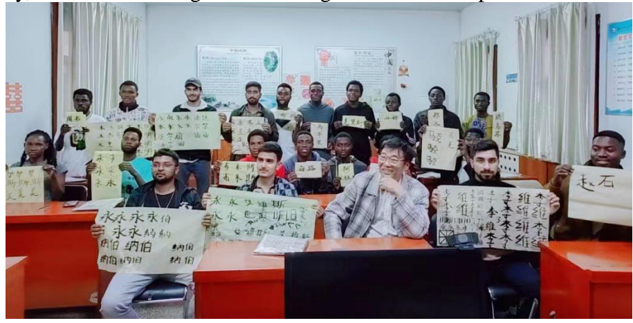
Figure 2: International students participating in educational and cultural exchanges

world education experience (Figure 2). Medieval universities in Europe established a basic framework in the history of world higher education development, while the University of Berlin in Germany made clear the important position of advanced research in modern universities, and Johns Hopkins University in the United States promoted the modern postgraduate education model [9]. The development and innovation of these higher education systems are inseparable from the active participation and promotion of international students. The influence of overseas students is not limited to the field of education, but also changes in politics, economy, ideology, culture and social customs of human society, sometimes leading to local changes and even complete revolution in some fields.