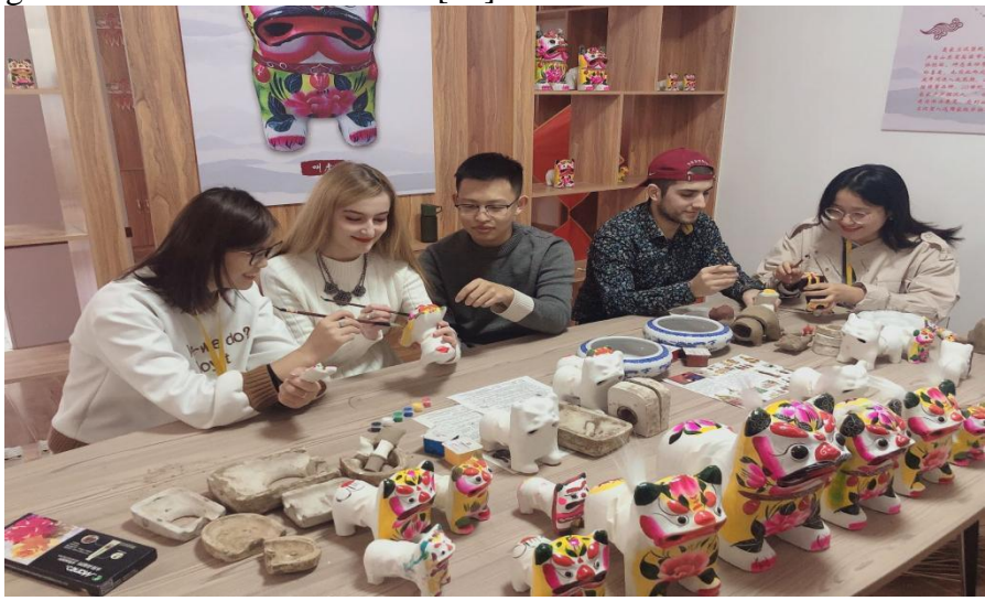
Figure 3: Cultural teaching activities

cultural teaching and cultural communication [12].