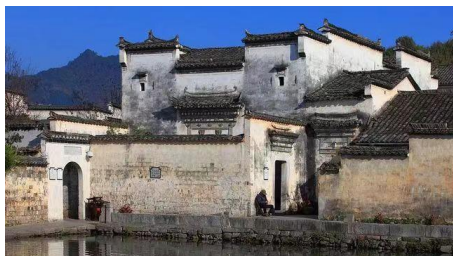
Figure 2 Huizhou architecture

The characteristics of Huizhou architecture are mainly reflected in the village houses, ancestral temples and memorial archways. No matter from site selection, design, modeling, structure, layout to decoration and beautification, Huizhou's mountain characteristics, geomantic will and regional aesthetics are all reflected. The overall color of Huizhou residential buildings is different from other cultural buildings. There is only one kind of simple and elegant color with white walls and tiles, which is restrained and implicit, and generally presents a color scheme with black, white and gray as the main tone , as shown in Figure 2.