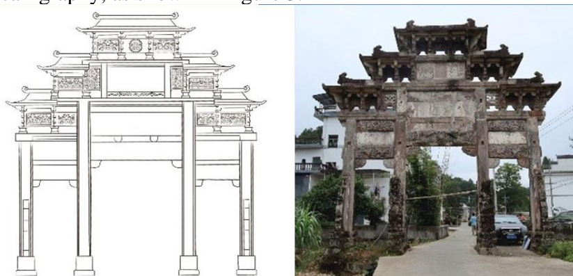
Figure 3. Schematic diagram of the author

Huizhou archway. Huizhou culture is one of the three wonders of Huizhou ancient culture, and it exists as a "three-dimensional history book" of Huizhou culture. Huizhou archway can't be described only from the perspective of architecture, but it is also a concentrated expression of painting, stone carving and even calligraphy, as shown in Figure 3.