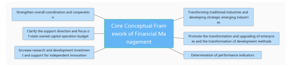
Figure 2: Core Conceptual Framework of Financial Management

The construction of financial management systems not only includes systems and frameworks, but also requires relevant financial management institutions. However, at present, Chinese enterprises generally only focus on the construction of financial management systems and frameworks, but completely ignore the related issues of establishing financial management institutions, this has caused Chinese enterprises to remain stagnant, without clear management objectives, let alone clear management ideas and methods. In addition, influenced by traditional concepts, various levels within the enterprise are generally unable to have a correct understanding of financial management, and even believe that financial management is "useless" Or think that financial management is the job of accounting [4]. Due to ideological deviation, people do not attach importance to financial management, and their financial management concepts are also very outdated, resulting in the current role of financial management only playing a small role in accounting work and low management. This situation is not conducive to the efficient operation of