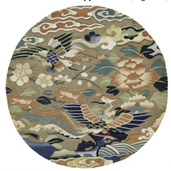
Figure 2: Tuanhua Medallion Pattern on Ming Dynasty clothing collected

The Qing Dynasty was a popular period for Tuanhua Medallion Patterns, famous for their distinct layers, exquisite weaving and embroidery, elaborate designs, realistic techniques, and rich images. The composition was mainly symmetrical, radial, and rotated, and was filled with various combinations of Tuanhua Medallion Pattern representing different auspicious meanings, such as "Dragon and Phoenix Bringing Auspiciousness", "Pine Age, Crane, and Longevity", and "Three Friends of the Year and the Cold", such as dragon, phoenix, crane, longevity, four group dragons, and four group styles "Eight regiments, dragons and phoenixes, and other fixed motif patterns of regimental flowers, especially in the Kang, Yong, and Qian dynasties, on the one hand, add a magnificent and noble atmosphere to clothing, while at the same time displaying a unique scene of a rich life". [4]