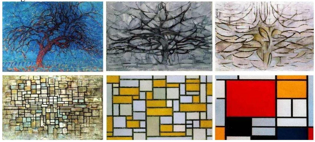
Figure 3: The Grey Tree by Mondrian, 1912; Composition in Red, Blue and Yellow by Mondrian, 1930

As can be seen from the figure 3, the painter Mondrian initially focused his painting on the study of vision. Gradually, he changed from imitating natural objects to subjectively expressing his emotions through images. Finally, in his works in his later years, painting completely transcends visual expression and transforms into a purely formalized form of expression, which announces the end of viewing behavior.