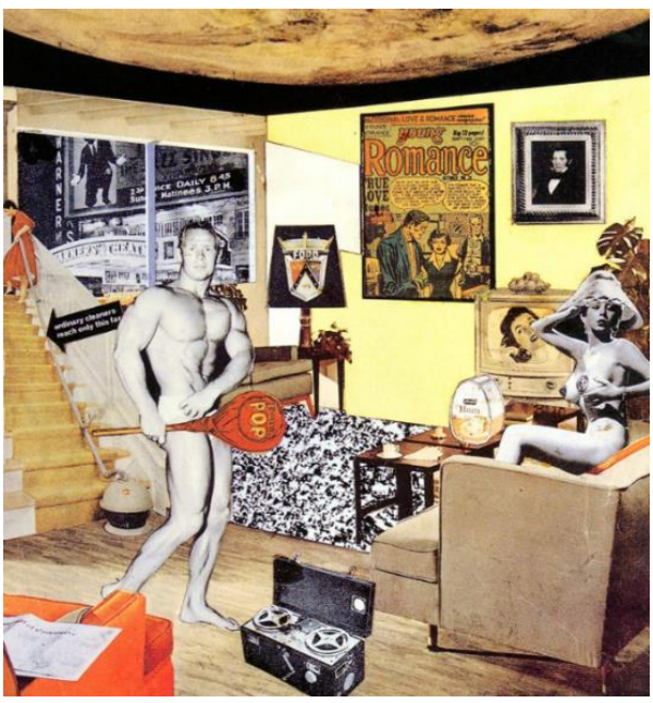
Figure 4: What makes today's families so different and so appealing? Richard Hamilton 1956

As is known to all, when people watch works of art, they are not simply visual behaviors. Our scientific knowledge, religious belief, language and context will come out to help us explain the world described in the picture. However, as a unique living individual, we all have a unique feeling for the real world around us, which cannot be completely replaced by images and language. When we look at a landscape painting, we usually focus on elements like color, shape, light and space, but no matter how realistic the landscape is, there is still a big difference between what we feel in the real landscape and what we feel when we look at the painting. The difference between "sight" and "image" makes people question whether images can reflect the reality of the world. This neverperfect coincidence is the secret that makes the works of art in Figure 1 so different. It is also this never-perfect coincidence that constitutes the eternal power and source of artistic creation.Image experience and visual representation are two different and coexist clues, which constitute the development of the whole human visual culture and evolve an extremely rich history of painting art.