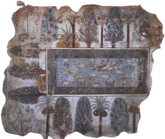
Figure 1: The Garden of Nebamon, About 1400 BC, from a tomb painting at Thebes, 64x74.2 cm, british museum, London.

Images are presented by people's viewing behavior. Making images is a process in which human's understanding of the objective world is fixed in the form of images through painting and sculpture. How humans view images reflects their attitudes toward art. In the religious life of early human beings, they opposed the creation of idol worship, and believed that once the image in religion was created, people would worship the image made of expensive materials and fine depiction rather than the god itself, which could generate huge temptation for the mentally weak believers and also cause the extravagance of the religious world. However, with the gradual secularization of religions, people needed to communicate doctrines directly and simply through images, and a large number of religious images were created, as shown in Figure 1.