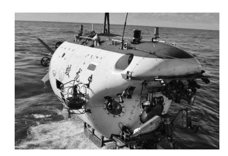
Fig.1 "Jiaolong" manned submersible