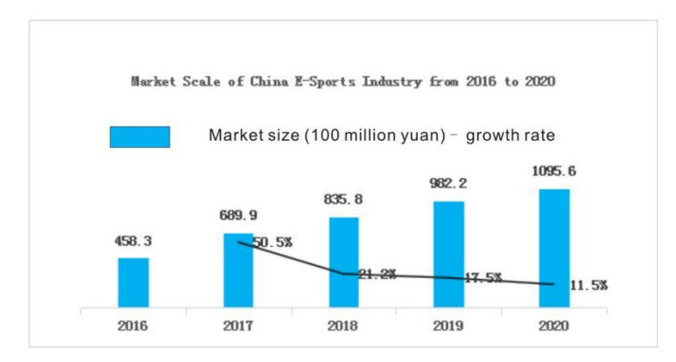
Figure 1: Market size of China's e-sports industry from 2016 to 2020