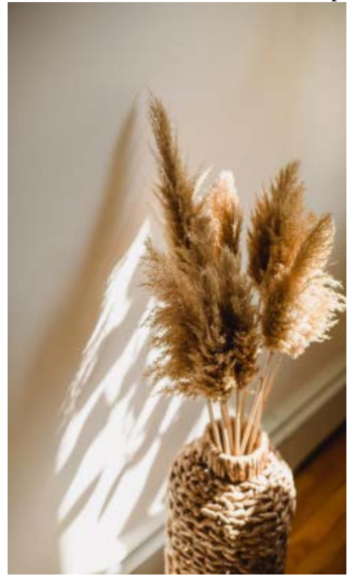
Figure 10: Space soft outfit collocation-3

(Figure 10). The space of the children's room as a whole is very romantic, a small and fresh pastoral country style. The pure white bed nets, white and brown double curtains blend with the overall tone of the room, and the bamboo chandeliers accentuate the rural atmosphere.