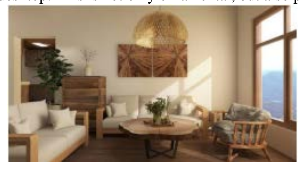
Figure 1: Living room area

The dining room (Figure 2) is the most common place for family members to communicate with each other except the living room. In the space, on the far left side of the dining table is a hanging kettle (Figure 3), which is used to boil water. It shapes the simplicity and comfort of rural life, and depicts nature in a simple style. The table is selected in the form of simple and beautiful lines. In addition, in order to enhance the delicacy of the table, the change of chair legs is added. The dining chair is also made of the same wood, which improves the comfort. Considering the use demand, we chose a table with a large desktop. This is not only ornamental, but also practical.