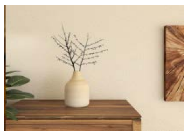
Figure 9: Space soft outfit collocation-2

The chairs in the Chinese restaurant in the restaurant space are made of logs, which are coordinated with the dark brown wooden ceiling in the hard-mounted space of the entire restaurant. The similar colors make the entire space more harmonious [9]. At the same time, the dining table is made of light beige logs, which adds a bright texture to the entire space. A traditional black iron hanging pot hangs next to the table. As a result, three shades of black, white and gray have been formed, which gives the entire space a further sense of layering, which is very simple and natural.