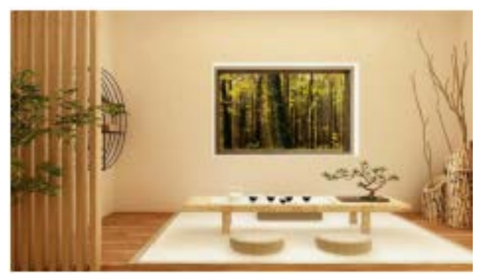
Figure 6: Tea drinking area

woven. Combined with the form of the space, bamboo woven lamps and lanterns not only appear natural and simple, but also show the natural characteristics of the country style. In the best-lit location of the study room, we designed a tea table with the temperament of a literati. It is a pleasant thing to have a cup of tea and chat with friends in the study room full of sunshine and books.