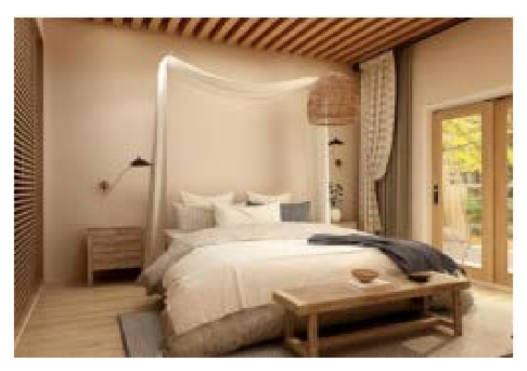
Figure 5: Separate bedroom