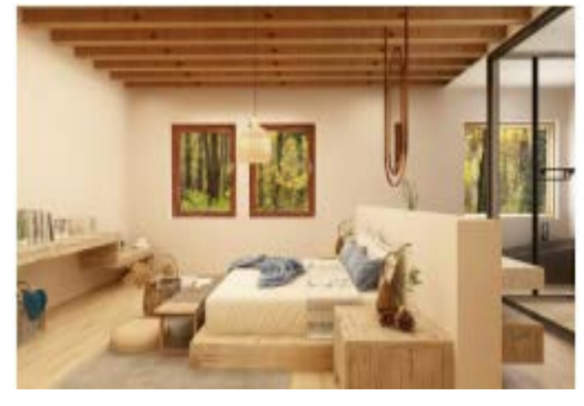
Figure 4: Open Bedroom

In terms of furnishings and layout, the most interesting space in the family is the bedroom space. The best rest space for people after a long day of fatigue and stressful work is the bedroom. Whether the bedroom has a good environment is very important for everyone's sleep state, and whether you can have a good quality of sleep is also very critical to people's mental state. The bedroom spaces designed this time are the main bedroom and the children's bedroom.