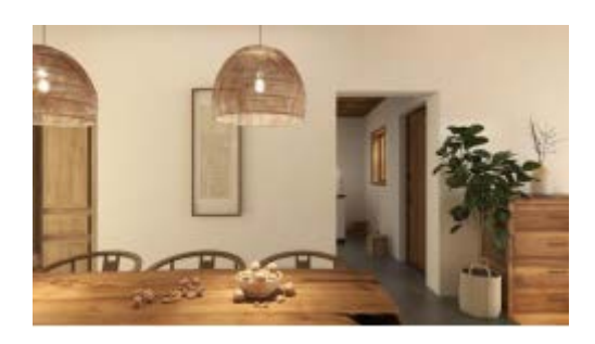
Figure 2: Restaurant area