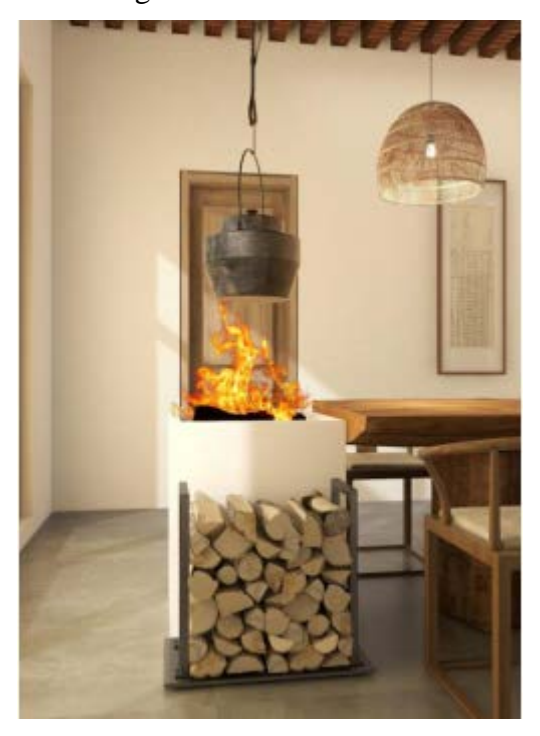
Figure 3: Dining table and hanging kettle

In terms of furnishings and layout, the most interesting space in the family is the bedroom space. The best rest space for people after a long day of fatigue and stressful work is the bedroom. Whether the bedroom has a good environment is very important for everyone's sleep state, and whether you can have a good quality of sleep is also very critical to people's mental state. The bedroom spaces designed this time are the main bedroom and the children's bedroom.