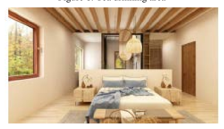
Figure 7: Natural style element space