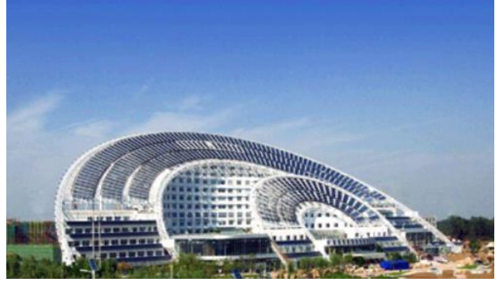
Figure 1: Texas Micro row Building

Texas micro row building, for example, it is the world's largest solar buildings, sun altar micro row building a total construction area of 75000 square meters, in the world to realize the solar hot water supply, heating, refrigeration, photovoltaic grid technology and building, building overall energy saving efficiency of 88%, can save 2640 tons of standard coal, 6.6 million degrees, reduce emissions 8672.4 tons, is the world initiative to realize the solar water heating, heating, refrigeration, photovoltaic grid technology and building<sup>[5]</sup>. As shown in Figure 1.