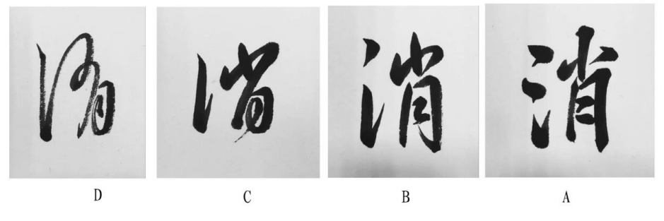
Figure 4: Guo Hongbao's cursive script

Rhythm is the soul of calligraphy art. Between a painting, the change fluctuates in the sharp end; within a point, it is extremely frustrating. If there is no rhythm in cursive script, it cannot give people a sense of beauty. The change of ink color, the thickness of the line, and the opening and closing of the structure are all very effective for adjusting the rhythm of cursive script. Let's take an example to understand the change of rhythm.