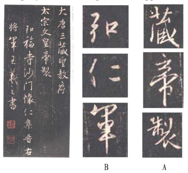
Figure 3: Wang Xizhi's cursive script

The cursive script does not do the general sense of the central palace, but shifts the center of gravity of the characters (Fig. 3A) or does a wide space treatment inside (Fig. 3B), which is actually a kind of Chinese character structure method. In an aesthetic sense, the "hollow" structure is not a "vacuum", but a combination of the virtual and the virtual, and the center of the word and the center of gravity are separated to different degrees, forming a different structural aesthetic relationship. The cursive style should pay attention to the small gaps divided by the stippling. These blanks should not be too many to avoid the feeling of loose and trivial structure, and they should not be too symmetrical. Mr. Sha Menghai proposed that the corresponding changes in the knot characters can also be made according to the direction of the horizontal painting. When the inclination angle of the horizontal painting is too large, the knot characters are mainly tight, and when the horizontal painting tends to be peaceful, the knot characters are mainly wide and broad. Most of the cursive knot characters are mainly obliquely drawn with tight knots, supplemented by flat drawn wide knots.