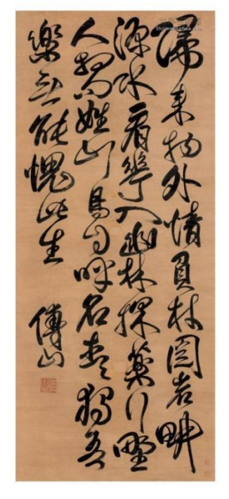
Figure 2: Fu Shan's cursive script