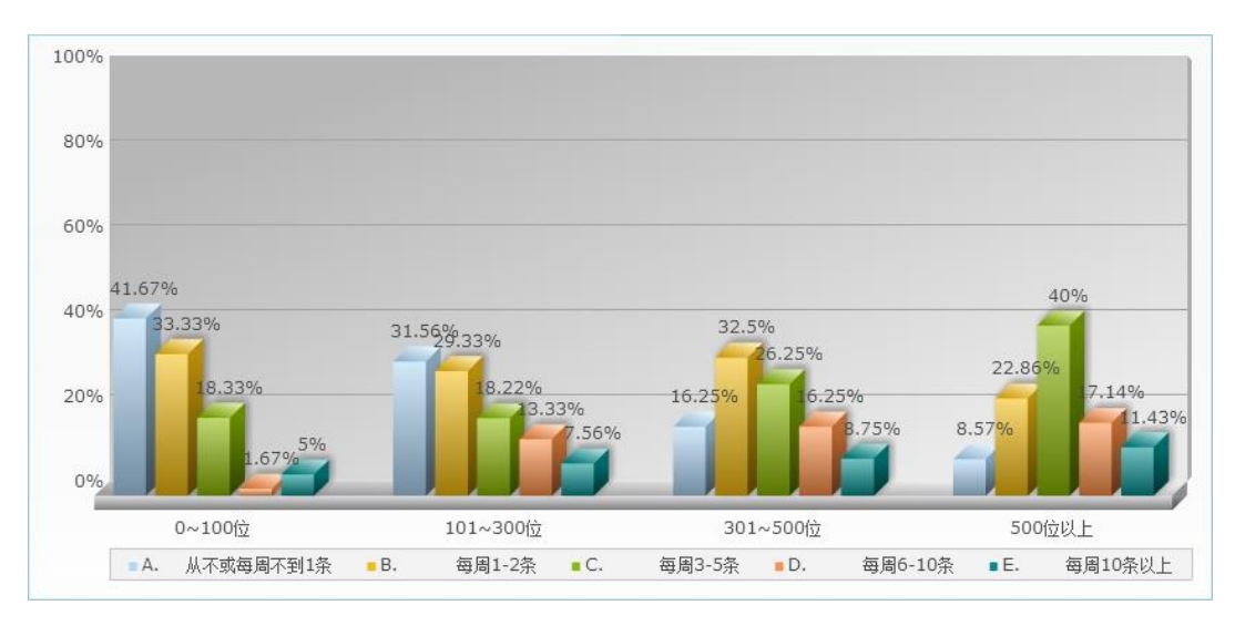
Figure 1: Weekly posting frequency on WeChat Moments