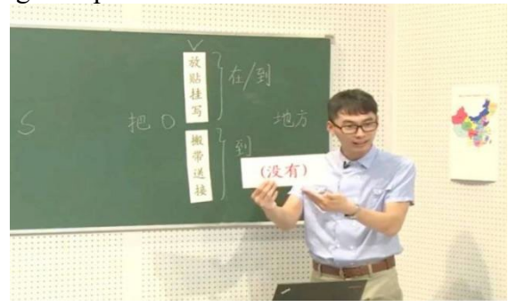
Figure 1: The blackboard writing of the teacher in Video 2

In this study, the visual modalities were divided into five categories: blackboard writing and text presented on PPT, PPT pictures (referring to static pictures presented on PPT), objects (pictures and objects displayed by teachers during explanations and drills), and videos. From the annotated data, the number of PPT text and drawings is the largest among the four teaching videos, and teachers seldom write on the blackboard, which proves that the classroom is no longer the traditional "textbook + blackboard + teacher speaking and students listening" model. Instead, they use a variety of modalities to fully engage students' senses in the classroom. In video 2, the teacher explained the structure of the word "Ba" by writing on the blackboard and using pictures to support the explanation, without choosing PPT presentation.