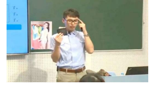
Figure 3: The metaphoric gesture of the pausing in video 1 Figure 4: The metaphoric gesture of thinking in video 2

Iconic gestures are mainly used when teachers explain vocabulary and explain a specific action, which can play a certain role in demonstrating, reducing the difficulty of students' understanding and facilitating their comprehension and memory. For example, in video 2, the teacher patted the blackboard with his palm when expressing the meaning of the verb "paste" in "paste a photo", and used the corresponding gesture to simulate the action of making a phone call when explaining the text.