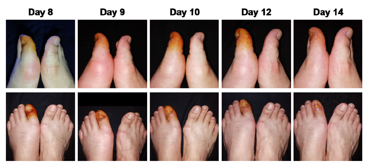
Figure 2: The appearance of first metatarsophalangeal joint and back of foot during gouty arthritis attacks. Day 8: The first day of gouty arthritis attacks, and the eighth day after the trauma, Day 9 to Day 14 and so on.