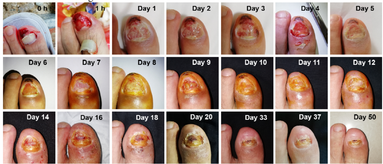
Figure 1: The healing process after toenail injury. 0h: Initial post-traumatic appearance; 1h: The appearance of the damaged nail after removal; Day 1: The first day after the trauma, Day 2 to Day 50 and so on.

day after the injury (a week after the gout attack), the swelling of his left first metatarsophalangeal joint and back of foot had subsided and the pain had been significantly relieved ( Figure 2, Day 14 ). He stopped ibuprofen but continued to take benzbromarone and sodium bicarbonate tablets for a week, then he underwent a laboratory test with uric acid levels at 87 \mu mol/L ( Figure 3, Time = 3.5 months ). Considering that the gouty arthritis was cured, he stopped taking benzbromarone and sodium bicarbonate tablets and changed to a conservative treatment to control blood uric acid levels through dietary adjustments. Two weeks later, he re-examined with the uric acid levels at 380 \mu mol/L ( Figure 3, Time = 4 months ). After that, he subsequently re-examined the blood uric acid on 3, 6, and 9 months after the gout attack, the level has fluctuated between 460 and 508 \mu mol/L ( Figure 3, Time = 6-12 months ). Now, the student plans to follow a strict diet under the guidance of his teacher to prevent a recurrence of gout.