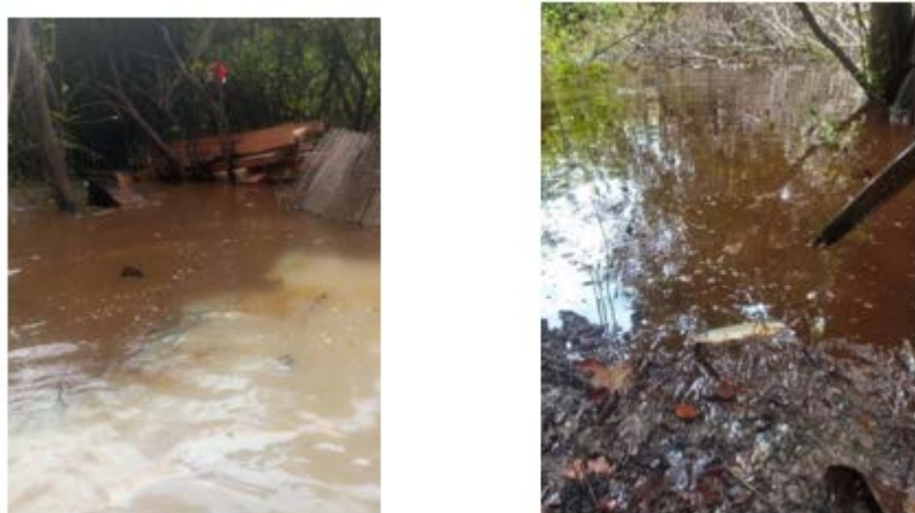
Figures 1 and 2. The crude oil spill on the water in Biseni Creeks and Lakes

water management regime. In this current study efforts were made to investigate the nature of crude oil spill on the physico-chemical parameters and metal load of water bodies of four (4) Creeks and two (2) lakes in Biseni Community in Bayelsa State, Nigeria.