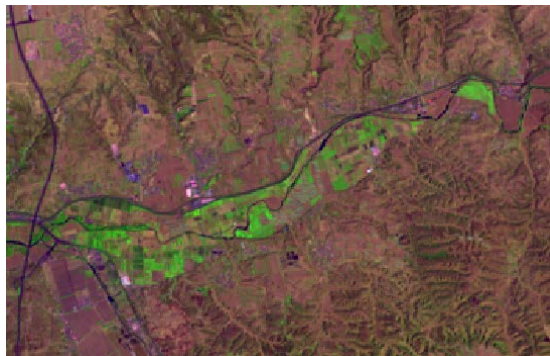
Figure.5 6, 5, 2 band synthesis

4) The false color synthesis of 6, 5 and 2 is used for crop monitoring, which can effectively interpret the cultivated land in mountainous areas.