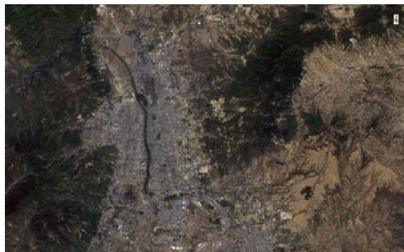
Figure.2 4, 3, 2 band synthesis

1) The combination of 4, 3, and 2 bands is a true color synthesis, which is mainly used to reflect the color of actual features.