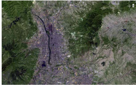
Figure.3 7, 6, 4 band synthesis

3) 5, 6, 4 false color synthesis, because the 6 band can make soil and water display higher contrast, so this color synthesis method can effectively distinguish land and water. The river in the mountains as shown below can be displayed more clearly than true color synthesis.