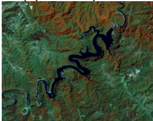
Figure.4 5, 6, 4 band synthesis

3) 5, 6, 4 false color synthesis, because the 6 band can make soil and water display higher contrast, so this color synthesis method can effectively distinguish land and water. The river in the mountains as shown below can be displayed more clearly than true color synthesis.