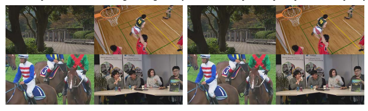
(a) 16th I-frame before embedding

Fig. 3 shows the 16th I-frame of video before and after embedding of watermark. The original 16th I-frame is shown as Fig. 3(a), the 16th I-frame after embedding watermark is shown as Fig. 3(b). As shown in the picture, watermarking don't give any noticeable impact on perceptual video quality.