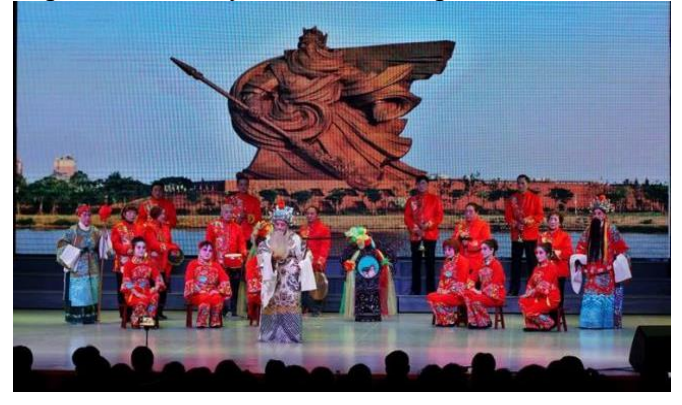
Figure 4: A still photo of the Jinghe Opera performance

With The Jinghe Opera, "The Great Return to Jingzhou"[3]The sixth "Ganlu Temple" is, for