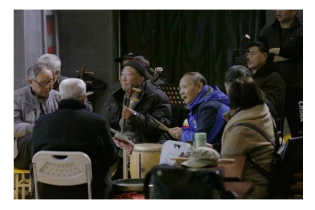
Figure 2: Traditional accompaniment team of Jinghe Opera