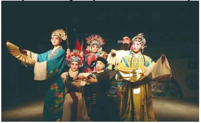
Figure 1: A still photo of the Jinghe Opera performance

Jinghe Opera is famous for its unique performance style and performance content (see Figure 1). From the performance content, Jinghe opera has its unique local characteristics of the "sweep", a exorcism disaster short ceremony, multi-purpose rooster sacrifice to achieve the purpose of blessing and evil spirit, in many "grass platform team" and local funeral etiquette also often appear. The performance characteristics of Jinghe Opera emphasize the skills of "eight inside" and "eight outside": "eight inside" emphasize the need to study hard in order to accurately show the emotional changes of the characters. The "outer Eight pieces" emphasize the need to constantly train all aspects of the body, including head, eyes, face, mouth, chest, back, hands and legs. The performance skills of Jinghe Opera are very exquisite, with special emphasis on the use of 'shaking color' and the use of eye skills, and the recitation of Jingsha dialect makes the performance of Jinghe Opera more challenging. Actors need to integrate these skills into the performance, so as to show the emotion of the role in a more vivid, vivid, accurate and profound way, so as to show the unique regional cultural atmosphere of Jinghe Opera, and become an important part of Hubei opera.