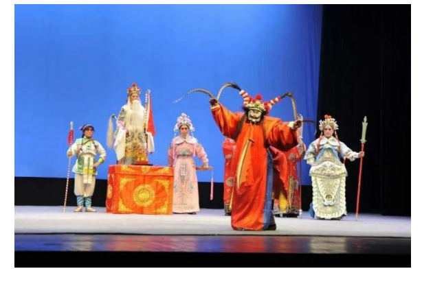
Figure 5: Face performance techniques

Because the local opera has always adhered to the traditional mentoring system, it is difficult to integrate with the modern education system. Without the participation of young people, the inheritance of Jinghe Opera cannot be sustained. Therefore, in order to inject new vitality into Jinghe Opera, we must take the initiative to integrate into the campus, select students who are interested, perseverance and talented in opera and cultivate them. It is gratifying that since 2015, Jingzhou Jinghe Opera Troupe has started in-depth cooperation with Yangtze University to popularize Jinghe Opera on campus (see Figure 5). The opera troupe performed in Yangtze University, Jingzhou Institute of Education and various middle schools in Jingzhou for many times, which aroused warm response. Although many local students know nothing about Jinghe Opera, they have developed a strong interest after watching the performance, and even have joined the amateur performance team.